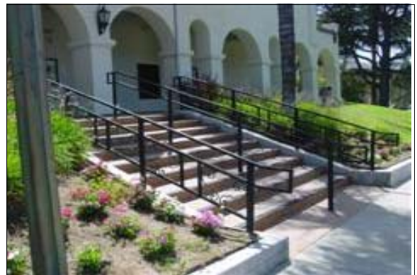
Path of Travel to the Main Entrance

Finding: There are only stairs on the path of travel to the primary entrance, preventing access to individuals with mobility impairments. There is no signage posted directing individuals with disabilities to the accessible entrance.