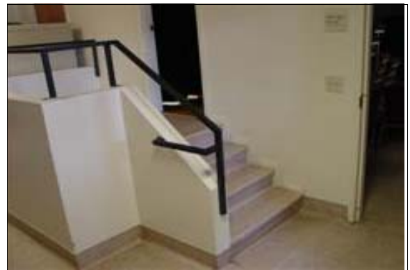
Interior Stairs to the Stage in the Verdugo Room

Full Rec: Affix detectable contrasting striping to the top and bottom treads of the stairway that clearly contrasts in color from the tread and is at least 2 inches in width placed no more than 1 inch from the tread nose or landing.