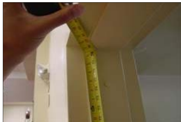
Interior Door to the Stage in the Verdugo Room

Full Rec: Consult a design professional to determine the feasibility of extending the height of the doorway to provide at least 80 inches clearance height (see CBC 1133B.2.3.1 and ADAAG 4.4.2).