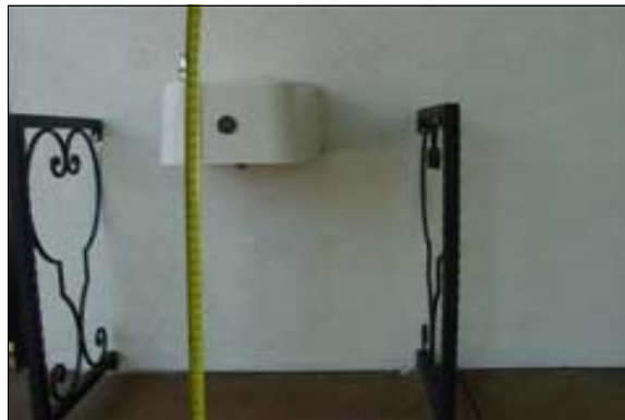
Drinking Fountain at the Rear Entrance

Finding: The drinking fountain is not a "high-low" design. The spout outlet height is greater than 36 inches.