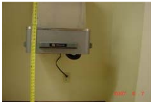
Drinking Fountain Next to the Restrooms

Finding: The drinking fountain is not a "high-low" design. The spout outlet height is greater than 36 inches.