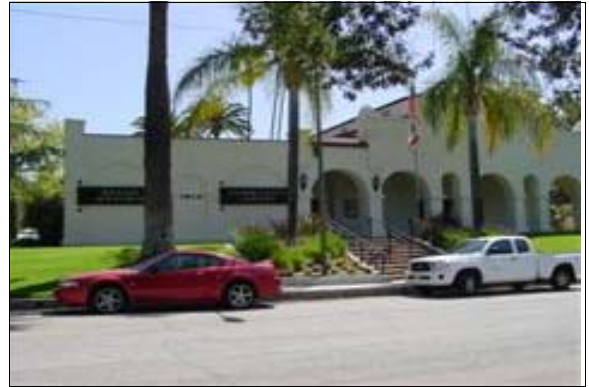
Accessible Route from the Public Right of Way

Finding: There is no accessible route from the public right of way to the accessible entrance of the facility.