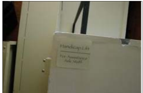
Platform Lift to the Stage in the Verdugo Room

Full Rec: Platform lifts must be capable of independent operation. Platform lifts shall not be modified in any manner or serve as an accessible means of egress. Platform lifts shall comply with CBC 1105.3, CBC 1104.1.4, ADAAG 4.11 and ASME A17.1 Safety Code for Elevators and Escalators, Section XX, 1990.