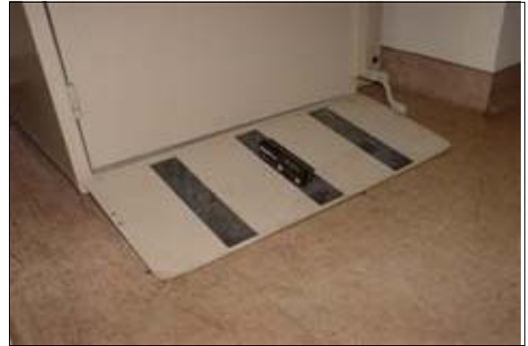
Platform Lift to the Stage in the Verdugo Room

Full Rec: Provide a level and clear landing at least 60 inches in length in the direction of the door swing.